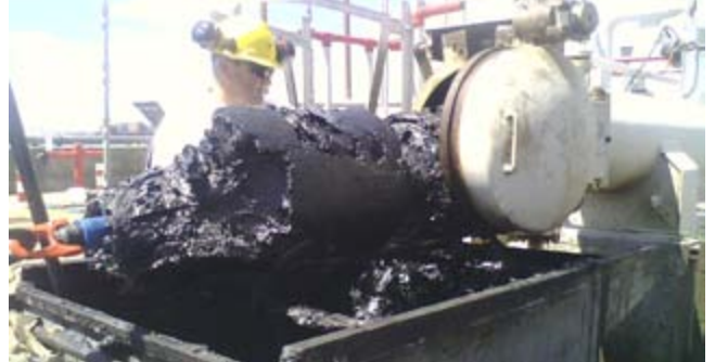
16" dewaxing MCT receiving

RHC SA proposes a tailored cleaning solution to