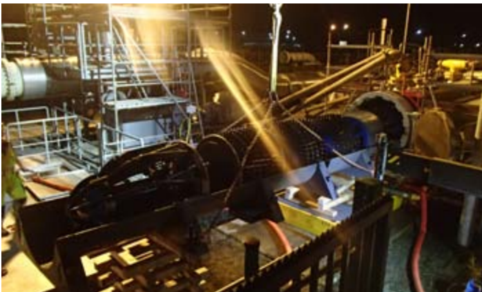
36" descaling MCT

The financial aspect of a project is not negligible. Comparing the different cost points without a global vision is a fatal mistake.