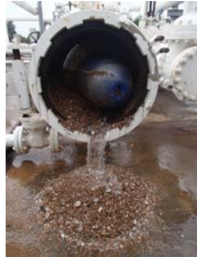
36" descaling MCT

Project related, the financial schemas are totally different.